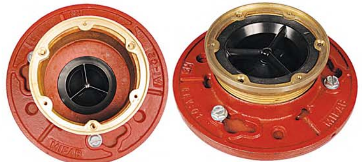
BOTTOM OF BODY